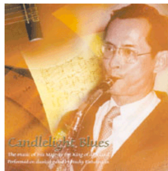
Candlelight Blues - photo on the album cover is H.M. King Bhumibol Adulyadej

Hucky: Oh, sure, completely. He's very open-minded and enthusiastic, especially about jazz and [Western] classical music. I have a little quote from the King on one of my albums of Royal music [ Candlelight Blues , 1999 AMI Records]: "Whether jazz or otherwise, music is a part of me. It is a part of everyone, an essential part of us all. To me, music is something fine and beautiful. I think we should all recognise the value of music in all its forms, since all types of music have their place and time, and respond to different kinds of emotions."